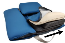
pic.3: elements insertion instruction