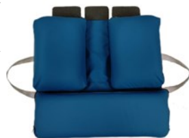
pic.1: extended cushion

Take the cushion and place it on the base (pic.1: extended cushion); adjust the modular elements (including elements inside them) as needed taking care not to bring them too close together, in particular, pay attention to those in the posterior part of the cushion to prevent the functionality of the cushion from being impaired (see in the standard maintenance section how to position the elements correctly).