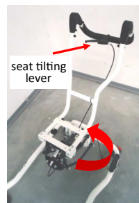
pic. 5: Tilt in Space

During the adjustments always ensure the anti-tip system is correctly activated and that the user is well placed in the seat using the pelvic belt. Also make sure that the forearms are positioned on the relative upper limb supports in order to avoid the risk of entrapment.