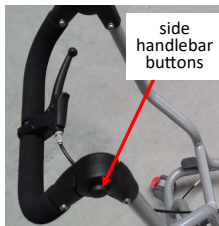
pic. 2: Handlebar adjustment