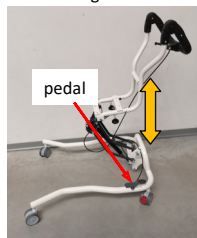
pic. 3: Height adjustment