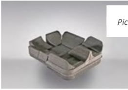
Pic.1: Pre-assembled structural kit