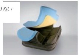
Pic. 3: Pre-assembled Kit + padding Kit