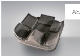
Pic. 1: Pre-assembled Kit