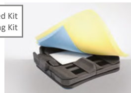
Pic. 3: Pre-assembled Kit + padding Kit