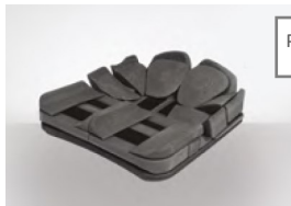
Pic. 1: Pre-assembled structural kit