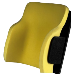
Pic. 3: Pre-assembled structural kit + Padding kit

The structural kit of Inserto Vip is composed by a flat base of construction and numerous inserts that can be customised, shaped, modified as needed (pic. 1 and pic. 2). Each element of the structural kit is supplied with male/female hooks and loops tape that strongly fix the inserts to the flat base of construction. The preparation of the trunk positioning system shape, based on the prescription and the end user's anatomy and morphology, is done through the detection of measurement and direct trials, therefore it has to be carried out as follows in order to ensure the proper commissioning.