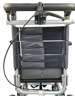
Pic. 5: Mounting on the wheelchair