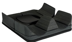
Pic. 1: Pre assembled structural kit