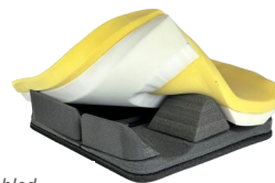
Pic. 3: Pre assembled structural kit + Padding kit