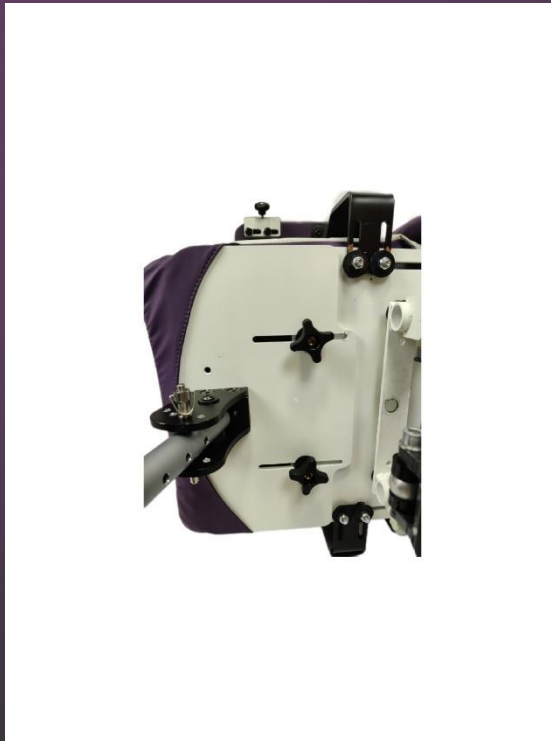
Length Adjustable Seat