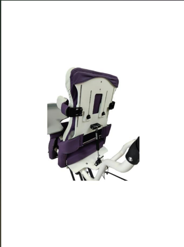
Reclining and Height adjustable Backrest