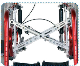
STABILISING CROSS BRACES