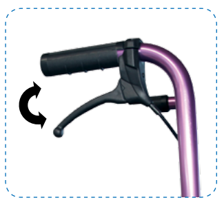
LEVER FOR TILT MECHANISM